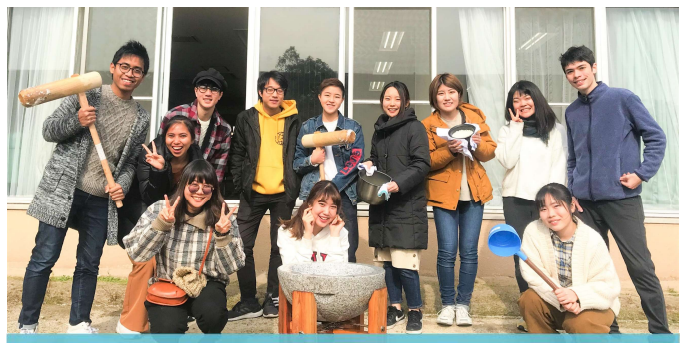
International Students are Enjoying Mochi Making

What would be a better treat in this season than Mochi? Mochi is a sticky rice, aka. Mochikome rice, which is pound in a sticky texture rice cake. Everyone gathered around a kotatsu, a Japanese low table with a heater underneath, eating mochi together while watching TV was a familiar seen we often see in Japanese films and series.