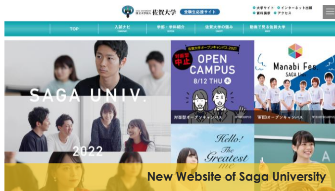
New Website of Saga University

Technology changes with time. People now beginning to use smartphone more often than they use personal computer. For me, navigating things on my finger lying on a couch is always better than hunching your back in front of a computer screen. That is why Saga University website's (URL: https://www.saga-u.ac.jp/ ) has change its user interface to be more user friendly for any devices. Through navigating it, you can find big stylish icons liking you to your desire webpage.